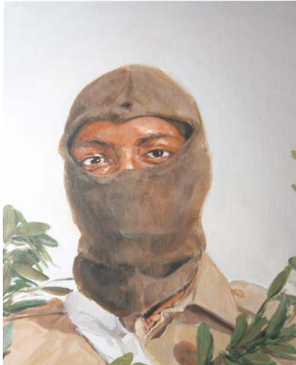
How long has it been, 2007 Oil on canvas, 20" x 16"